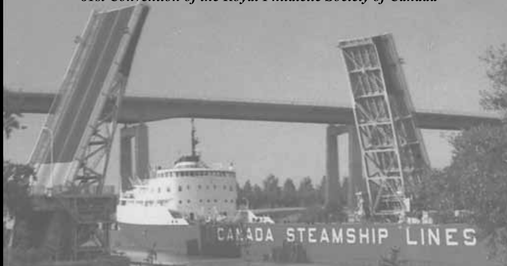
Homer Bridge • Welland Canal, St. Catharines, Ontario, Canada

Canada's National Stamp Exhibition 81st Convention of the Royal Philatelic Society of Canada